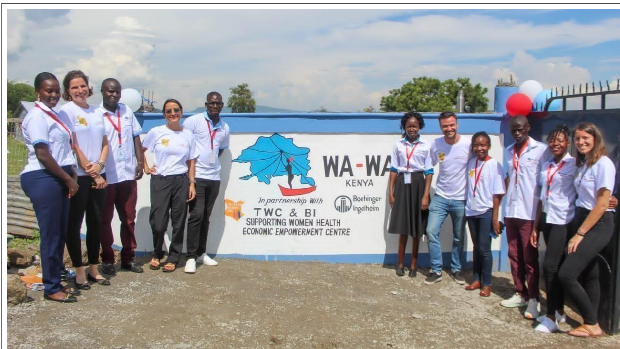
A section of our staff at Kaugege

Additional staff were recruited in Programs Management, Farm Operations, and Computer Training, significantly enhancing coordination, technical delivery, and beneficiary follow-up.