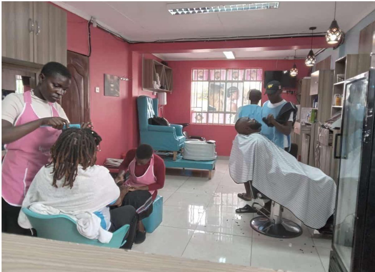
WA-WA Kenya barber & beauty palour

The enterprise employs seven staff, most of whom are program graduates, providing stable income, mentorship, and real-world business exposure while strengthening WA-WA's sustainability model.