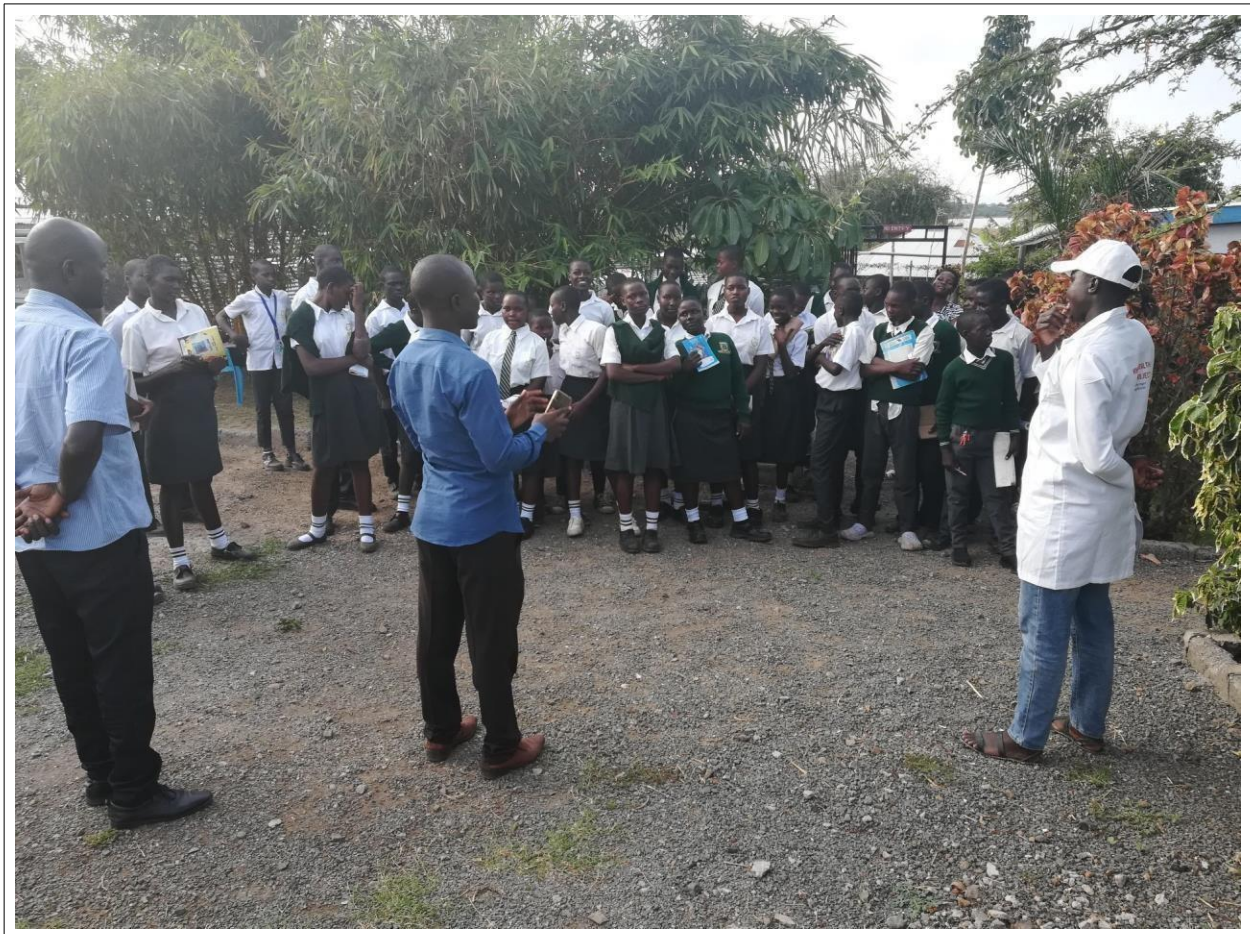
Students from Kirindo primary exploring our center at Kaugege

Community engagement remained a defining pillar of WA-WA's approach in 2025. Through sustained outreach, dialogue forums, advocacy initiatives, and school-based engagements, WA-WA strengthened trust, visibility, and ownership of programs within target communities. These engagements fostered open conversations around gender equality, youth participation, sexual and reproductive health, and economic justice.