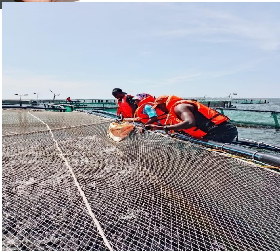
Checking the fish cages at lake Victoria. This project is by our partners Rio Fish