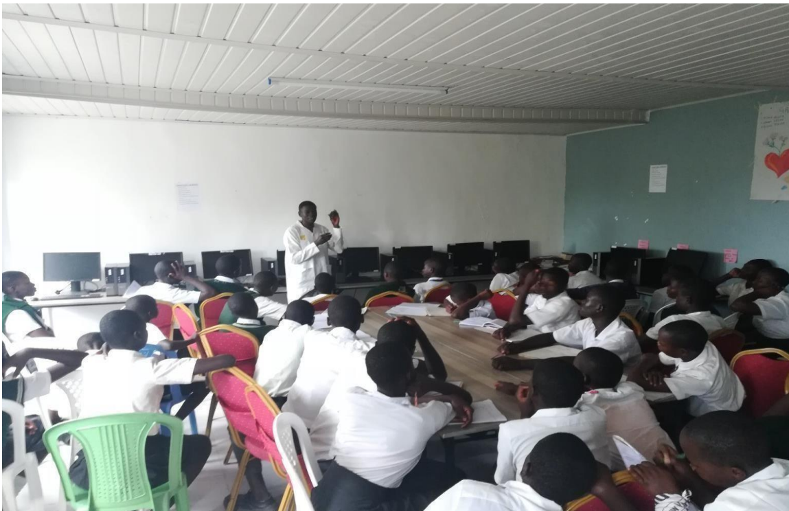
Youth from the locality welcomed to our center for capacity building

WA-WA continued to champion community advocacy through sustained sensitization forums, policy dialogues, and partnerships with local stakeholders. These efforts strengthened community ownership, enhanced awareness of rights and services, and fostered collective action toward social justice.