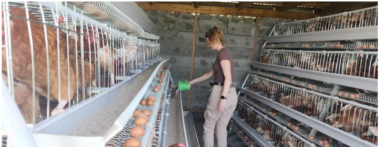
One of our chicken coups located at Kaugege

The enterprise generates steady income, provides hands-on agribusiness training, improves food security, and enables women to replicate poultry farming at household level, contributing to long-term economic resilience.