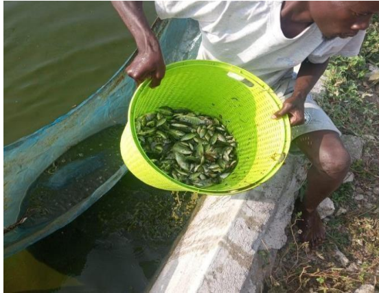
Transferring fingerlings to the main cage